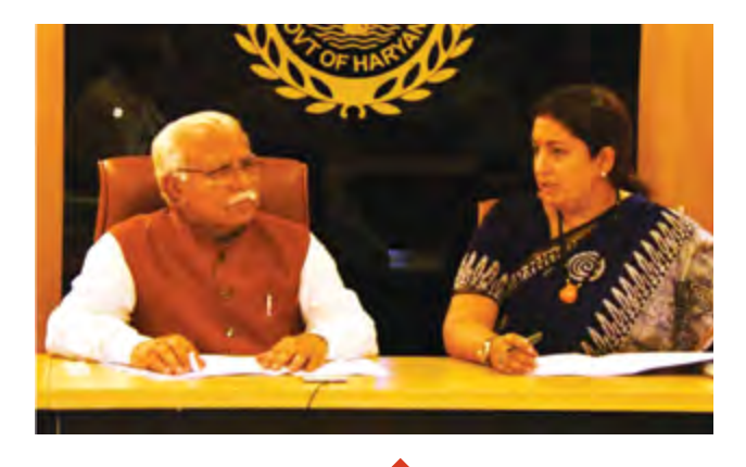
Hon'ble Minister of Women and Child Development in conversation with Hon'ble Chief Minister of Haryana

She also called upon Hon'ble Chief Minister, Shri. Sarbananda Sonowal in Guwahati, Assam, to discuss the progress of POSHAN Abhiyaan in the State.