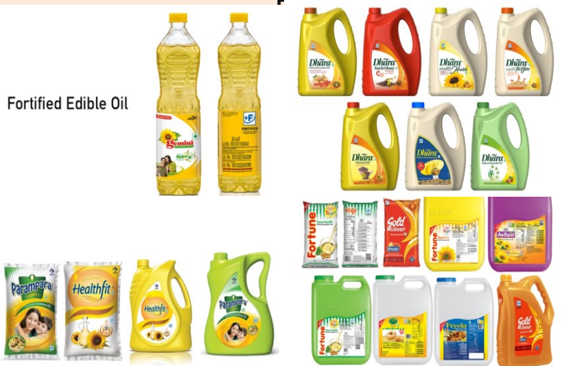
Fortified Edible Oil